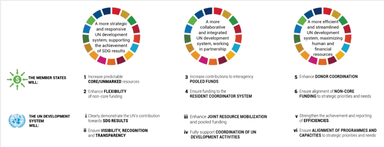
Figure 2: Summary of Funding Compact commitments (updated May 2024)

The Secretary-General provides annual reports on the implementation of the QCPR to the General Assembly and Economic and Social Council (ECOSOC). Since 2020, contributions to operational activities (humanitarian and development combined) have steadily increased, but this was largely due to increased earmarked funding for specific projects or programmes. Core funding as a share of overall funding has decreased from 29.6 per cent in 2019 5 to 16.5 per cent in 2022 6 , (see Figure 3) far from the 30 per cent target set out in the Funding Compact