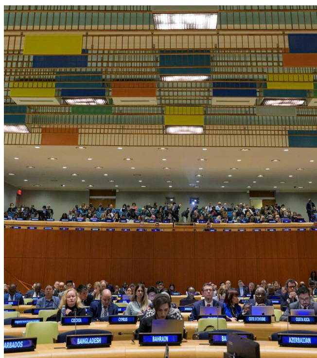
Economic and Social Council Forum on Financing for Development

Furthermore, it was found that (joint) interventions developed a resource mobilization strategy late in the project timeline, or did not track or utilize it sufficiently or had no sufficient human resources to perform this responsibility due to a lack of dedicated funding for targeted resource mobilization positions. Those resource mobilization strategies in place were highly dependent on traditional donors, with few entry points for expansion to increase in-kind contributions from development partners or funding from the private sector or individual giving.