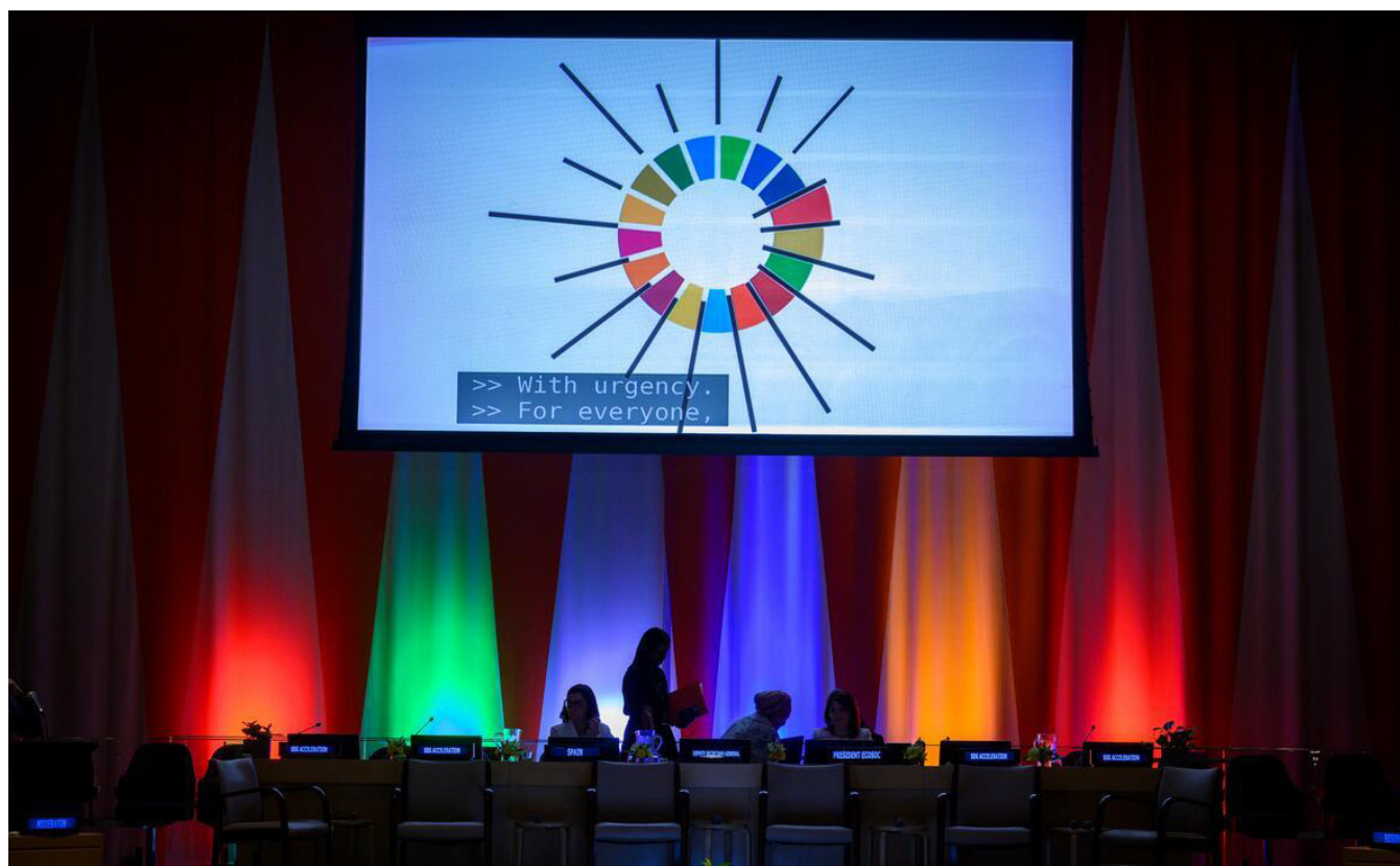
Special Event on SDG Acceleration during High-level Political Forum

Limitations: Analysis of funding quality was a common feature of the sampled evaluations. However, the quality and depth of this analysis varied, limiting the findings of this summary. There was limited in-depth analysis of: (i) the value proposition and value for money of the inter-agency pooled funding modality; (ii) donor behaviour at the country level; (iii) efforts to secure core and flexible funding; (iv) the use of and differences between light and tight earmarking; and (v) implementation of the Funding Compact. These topics may warrant greater attention in future evaluations.